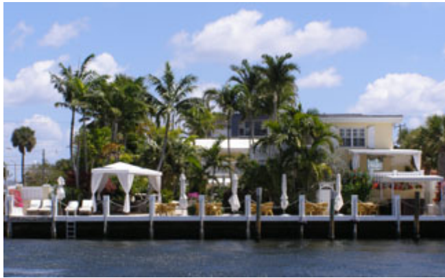
The Pillars at New River Sound View From The Intracoastal

The minute that I entered the hotel and saw the leopard print carpet on the curved stairway, the inviting table in the foyer with multi-tier silver candy basket laden with sweets, and the warm and welcoming greeting at the reception desk, I knew that this was going to be a wonderful experience.