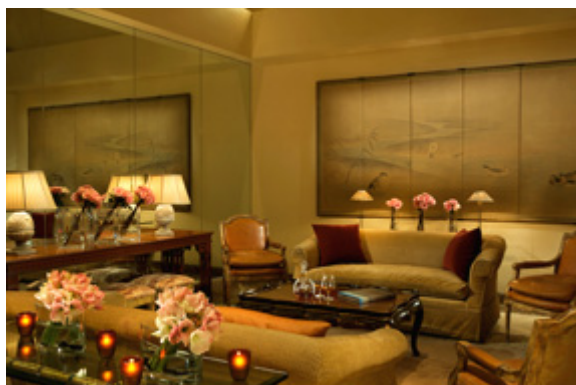
Campton Place San Francisco Lobby Lounge

For guests looking to get more exercise than just walking up the hills of San Francisco, there is a well-equipped Fitness Center located on the 9th floor of the hotel, and the hotel also provides guests with an interesting jogging map.