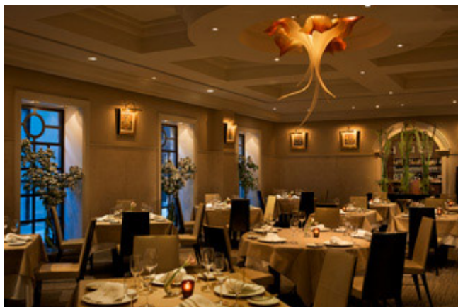
Campton Place Restaurant

We had a memorable nine-course tasting dinner at the restaurant with wine pairings, where a few of the many highlights of the dinner included Jerusalem Artichoke Soup with Slow Cooked Hen Egg, Truffled Tapioca Pearls and Dry Ginger Dust, paired with a Grüner Veltliner Laurenz V Kamptal 2006; Roasted Red Beet, Beet Curd, and Andante Dairy Minuet Cheese Snow paired with a Sancerre Alphonse Mellot, Loire Valley, 2007; Barely Seared Scallops, Almond Soup, Fig Compote and Prosciutto Ham Chips paired with a Chardonnay Silver Mer Soleil Unoaked, Monterey County 2006; and Braised Beef Short Ribs, Truffled Potatoes, Wild Mushroom, Salsify, and Braising Juice paired with a Cabernet Sauvignon, Salvestrin Estate, Napa Valley 2004.