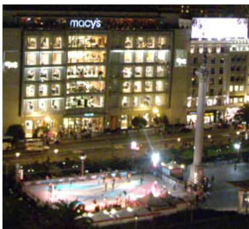
View of Union Square with Ice-Skaters

From our spacious 14th floor corner guestroom, we had a sensational view of Union Square where we could watch the ice-skaters gliding around the ice while palm trees framed the seasonal ice rink.