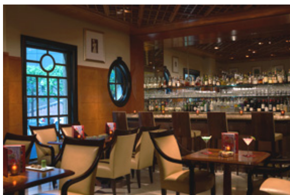
Campton Place Bar and Bistro

The hotel has lovely little details including Matisse signed and numbered lithographs that grace the lobby walls leading to the intimate Campton Place Bar and Bistro which features casual dining and an innovative cocktail menu including their signature cocktails, the Campton Cure (Ketel One Citron, Lime, Cointreau, and Cranberry Juice); the Cucumber Gimlet (Ketel One, Kaffir Lime Leaves, Cucumber, and Lime); and the Caipirinha Verjus (Leblon Cachaça, Lime, Red Grapes). In addition to their creative cocktails, the well-stocked bar offers a wide selection of spirits as well as wines and champagnes by the glass. Tea drinkers will appreciate the intriguing tea menu including Pu-erb, Green, White, and Herbal selections, and a tea that definitely caught my eye was the Cold and Flu Blend.