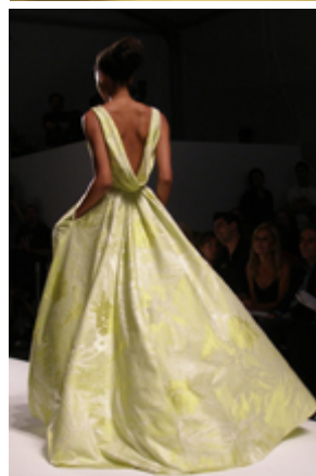
Designs by Joanna Mastroianni

A few of the highlights of the collection included an Indigo strapless "Duquette" dress with hand beaded malachite and onyx stones; Chartreuse evening ensemble with skinny pants and cowl back; Tangerine "Sabrina" bias silk dress; Chartreuse "Artemis" gown; White silk "Athena" gown; and White silk "Aphrodite"