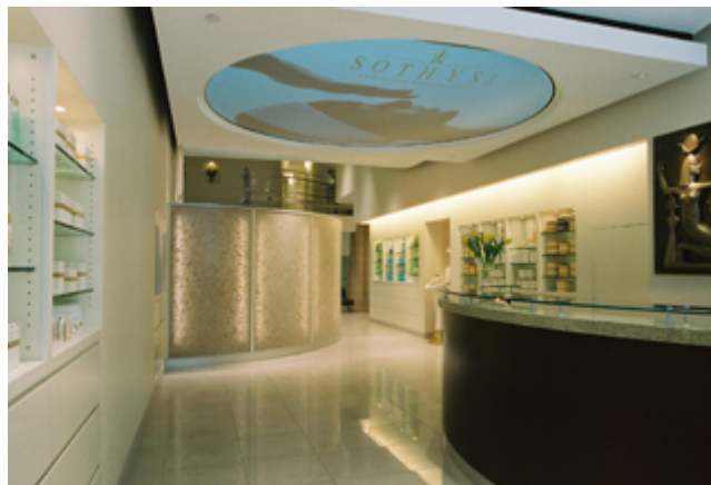
Sothys Spa Reception

We entered the door to the attractive 5,000-square foot Sothys Spa, (The L'institute Sothys, New York) which opened in 2005, and the first thing that we noticed was the light, pleasant scent in the air, soothing colors, and the professional welcome by the staff.