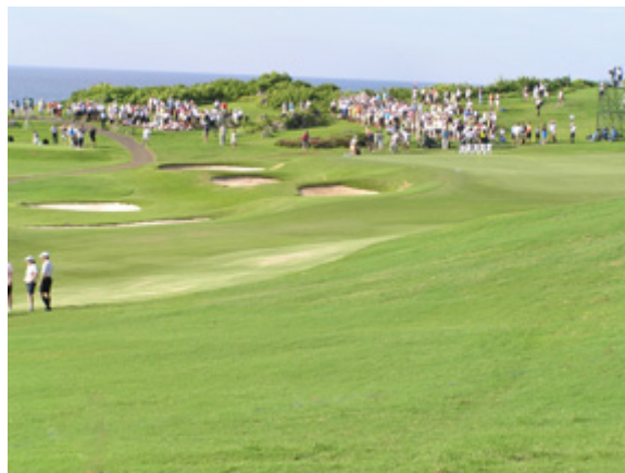
The Mid Ocean Club

In October 2007, we traveled to Bermuda to attend the 25th PGA Grand Slam of Golf, which took place from October 15-17, 2007 at the legendary 6,666 yard, par 70 The Mid Ocean Club , designed by Charles Blair MacDonald in 1921. This was Bermuda's inaugural PGA Grand Slam of Golf, held for the first time outside of Hawaii.