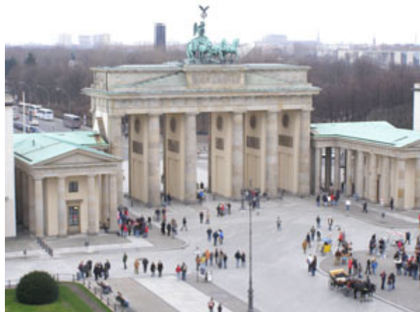
View from the Suite

Located on the prestigious Unter den Linden, the 385-room and 80 suite hotel features lavish appointments in all of the guestrooms. We stayed in the Pariser Platz Suite with stunning views of the Brandenburg Gate where we felt like we were a part of history in the making as we looked out our windows framed with floor to ceiling champagne and gold fabric.