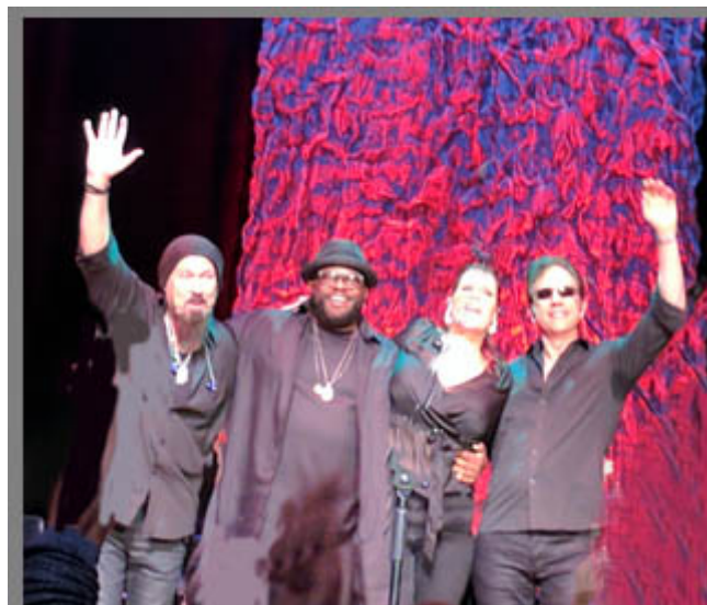
Beth Hart and the band