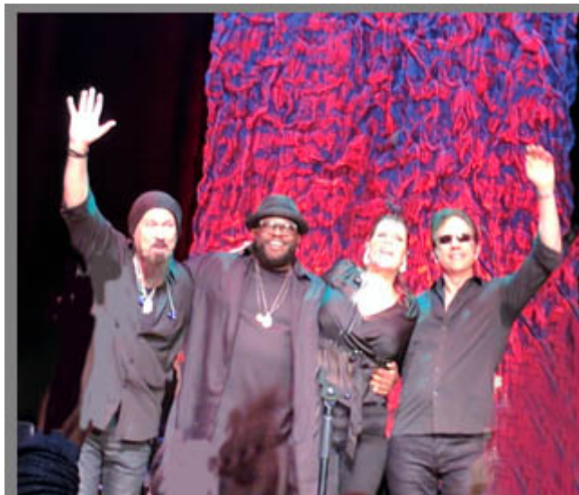
Beth Hart and the band