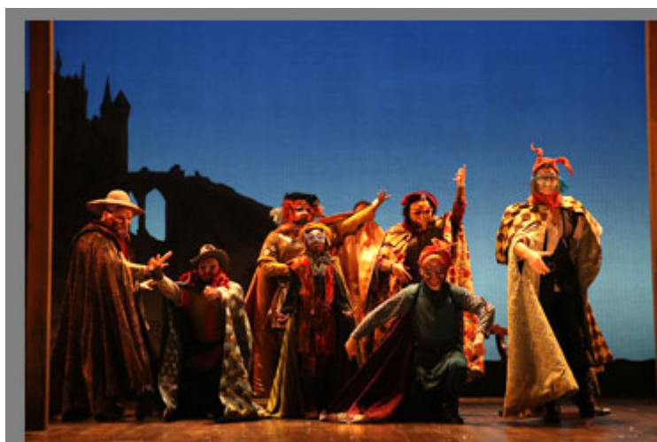
Revelers - Camelot