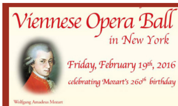
Viennese Opera Ball at Waldorf=Astoria

For more information about the Viennese Opera Ball, please visit the website: www.Vienneseoperaball.us