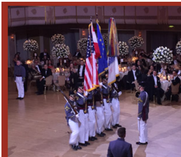
West Point Cadets

It was a magical evening of music and formal elegance at The 61st Annual Viennese Opera Ball (VOB) held at the Waldorf=Astoria in New York City on February 5, 2016 benefitting the Ronald McDonald House New York in partnership with New York Rotary Foundation , and honoring the 260th anniversary of the birth of the Austrian composer Wolfgang Amadeus Mozart .