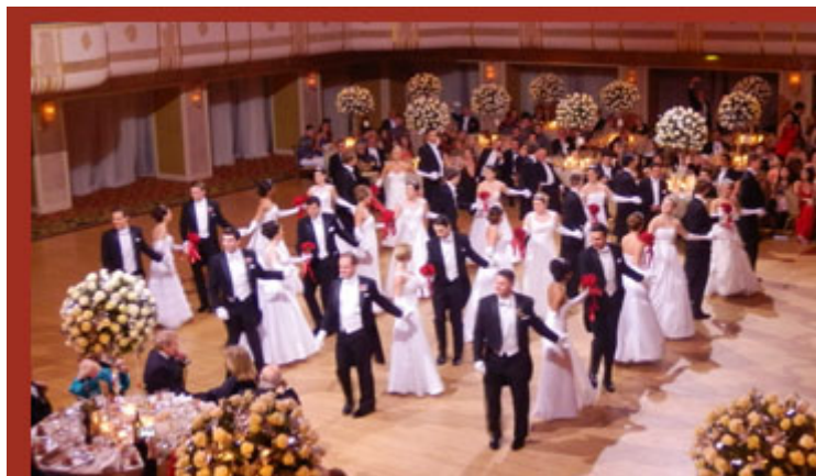
Debutantes with Escorts