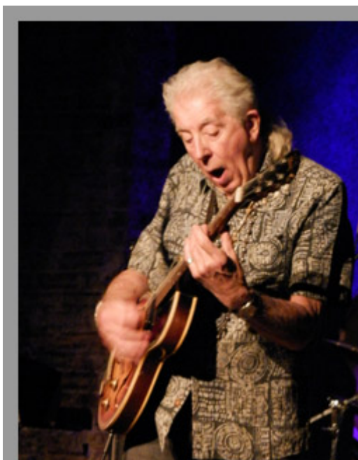
John Mayall at City Winery, NYC