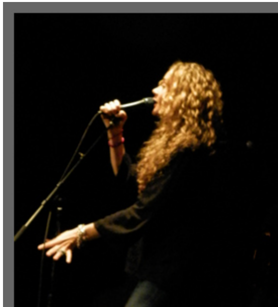
Dana Fuchs - Rocking On