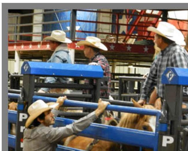
Cowboy's waiting their turn

Professional rodeo categories include Roughstock and Timed Events. Roughstock events include: Bareback Riding, Saddle Bronc Riding, and Bull Riding where "a contestant must stay on the animal for 8-seconds while using one hand to make a qualified ride and his score is determined not only by his performance but that of the animals as well. Judges score the ride and the contestants are awarded between 0 to 25 points, and the animal's effort is also awarded between 0 and 25 points. The scores are then combined to give the contestant their score. It is important to note that if the cowboy touches any part of the animal or himself with his free hand, he is disqualified." Although 8 seconds may not seem like a long time to you, for a contestant trying to hang on for points, 8 seconds must feel like a lifetime.