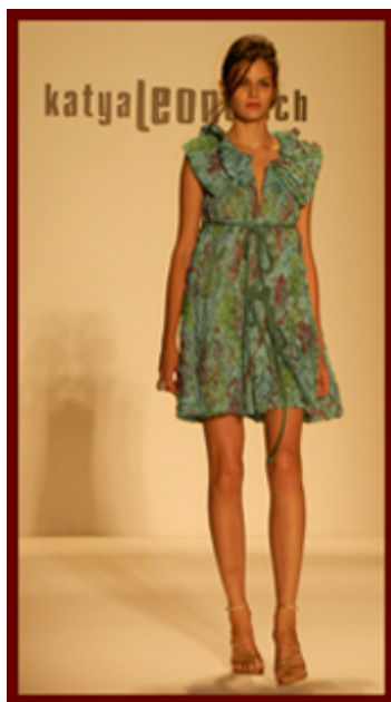
Design by Katya Leonovich

There were many show highlights including two attractive sleeveless coats, which included a mid-thigh length, empire-waist lilac sleeveless crinkled coat dress with double collar, rope belt, with elbow to wrist sleeves , and a printed sleeveless crinkled coat dress with rope belt . Also of interest was an attractive crinkled linen coat .