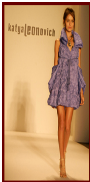
Design by Katya Leonovich

There were many show highlights including two attractive sleeveless coats, which included a mid-thigh length, empire-waist lilac sleeveless crinkled coat dress with double collar, rope belt, with elbow to wrist sleeves , and a printed sleeveless crinkled coat dress with rope belt . Also of interest was an attractive crinkled linen coat .