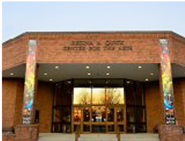
Quick Center for the Arts

Conveniently located in Fairfield, Connecticut, the Quick Center for the Arts is a 30-minute drive from Greenwich and New Haven, a 60-minute drive from Hartford, and a 90-minute drive from New York City. The Quick Center for the Arts has an extensive program of theatre, dance, opera, classic, and jazz series, as well as family productions throughout the year.