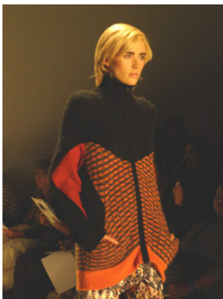
Design by Designer Yuya Kubohara

orange skirt and purple leggings; blue print sleeveless jacket paired with a yellow skirt; and a gray and orange knit coat paired with navy pants.