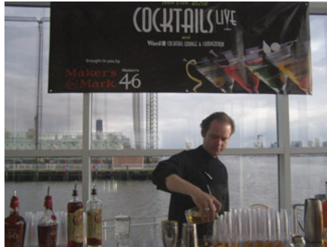
Cocktails Live at Whisky Live

Whisky Live guests had the opportunity to chat one-on-one with master distillers, family members, and brand ambassadors to learn about the diverse selection of products through tastings, cocktails, as well as by attending one of the many master classes.