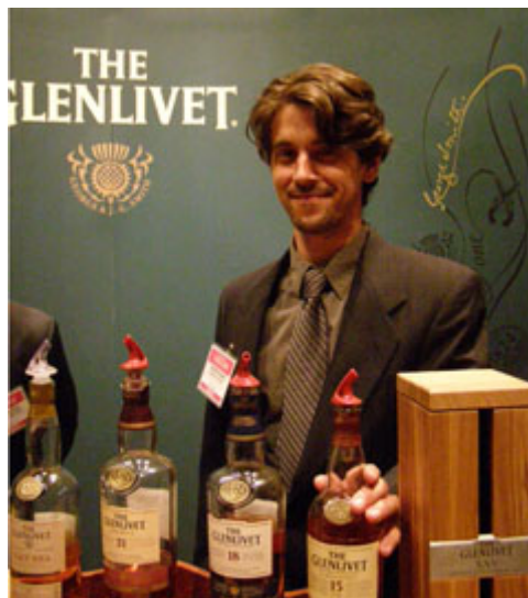
The Glenlivet Pouring

Also returning to Whisky Live was High West Distillery, Johnnie Walker, Knob Creek Bourbon, Laphroaig, Longmorn, Maker's Mark, Michter's Bourbon, Notch Whiskey, Old Pulteney, The Balvenie, The Glenlivet, The Singleton, The Small Batch Bourbon Collection, and William Grant & Sons.