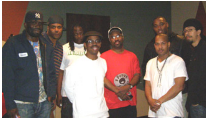
Rebirth Brass Band