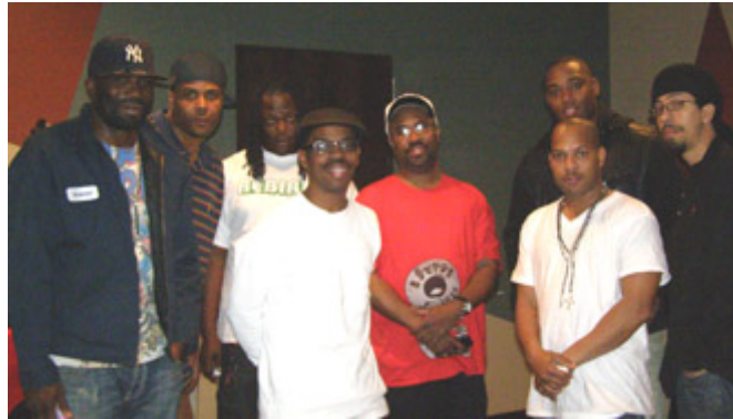
Rebirth Brass Band