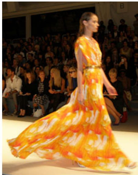
Designs by Carlos Miele

Bold and vibrant describes his Vivid Blue Silk Charmeuse Long Dress ; Vivid Green Silk Charmeuse Long Dress with Gold Metal Mesh Belt open shoulders and deep plunging neckline; and his Vivid Blue Silk Taffeta Long Dress with Light Blue Silk Faille Detail .