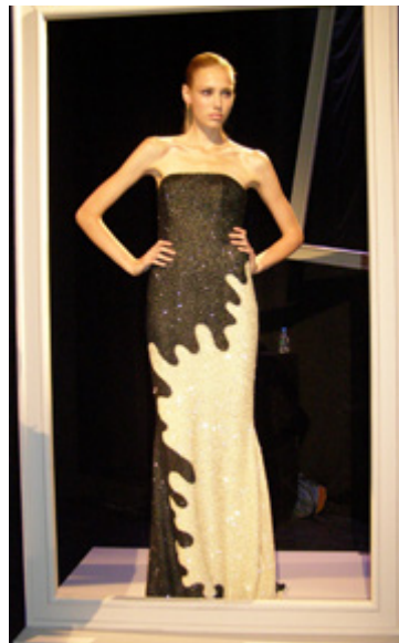
Designs by Pamella Roland

A few of the other gown highlights included a Sterling Blue Bias Strip Chiffon Embroidered One-Sleeve Gown with Antique Gold Brushed Detail ; a figure hugging Pale Navy Fully Beaded V-neck Gown with Bias Chiffon Detail and cap sleeves and a small trailing train; a Lavender Silk Crepe Back Satin Gown with Sequin Embroidery and Piping Detail ; and an Ivory Silk Faille Halter Top with Tie Neck paired with an Ivory Silk Faille Ball Skirt with Layered Bow Back Detail .