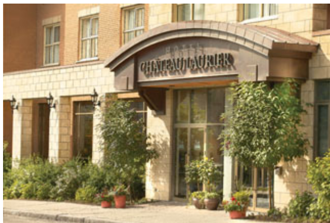
Hotel Chateau Laurier

The 289-room hotel located on the corner of Place George-V Ouest and the Grande Allée promotes French culture and introduces guests "to the wonders of the Francophonie - the French-speaking countries and communities worldwide." In keeping with their theme of being "francoresponsible" there is a Francophonie flag above the main entrance of the hotel, piped-in French music plays throughout the hotel in the public spaces, in the guestrooms there are French music CDs and the radios are programmed to French-language stations. The hotel provides complimentary French newspapers in the comfortable lobby, and offers complimentary passes for guests to experience the Centre de la francophonie des Amériques , and the Musée de Amérique française .