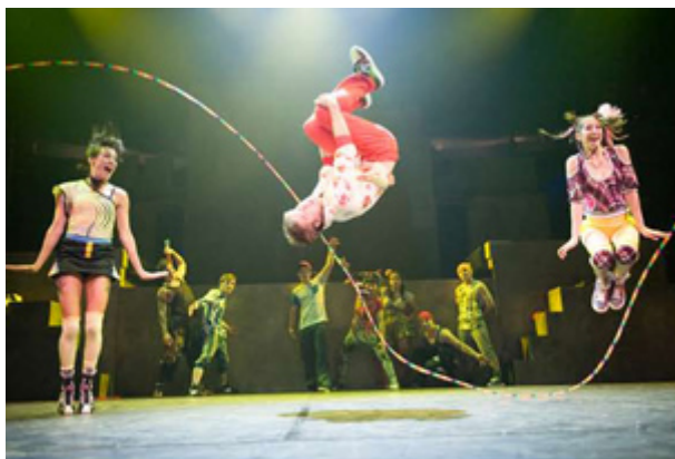
Cirque Éloize - iD Artists

It was indeed a special summer evening sitting under the big top tent on the Quay of Old-Montréal as fourteen talented artists from ten circus disciplines kept us enthralled with their level of skill from the opening act until the show ended with a standing ovation from the appreciative audience.