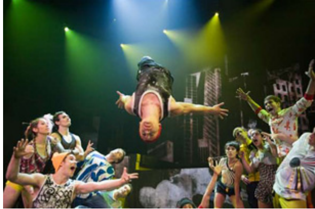
Cirque Éloize - iD Artists