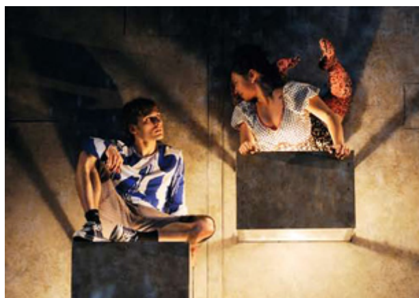
Cirque Éloize - iD Artists