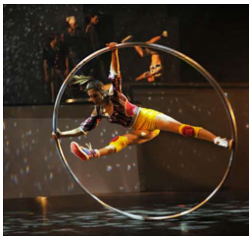
Cirque Éloize - iD Artists

Cirque Éloize , pronounced Cirque El-Waz, takes its name from a "word that comes from the Magdalen Islands and means 'flashes of heat lightning seen on the horizon.' An inspiration for the troupe's seven founding members, this lightning symbolizes the heat and energy that feed the troupe's spirit." Founded in 1993, Cirque Éloize has impressive credentials of having created seven original productions, has completed almost 4,000 performances in 375 cities in 30 countries, and is a leader in the contemporary circus arts.