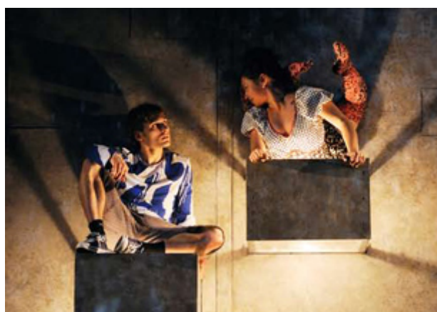
Cirque Éloize - iD Artists