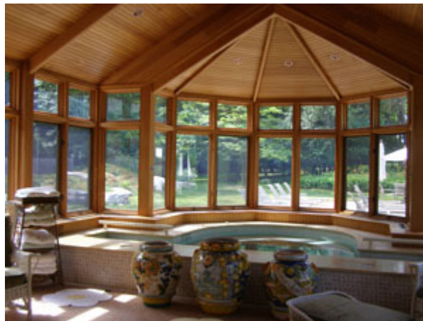
The Potting Shed at Blantyre Greenhouse Hot Tub

beneficial, which I followed by a session in the sauna, steam room, and hot tub, with alternating cold showers to cool down between sessions.