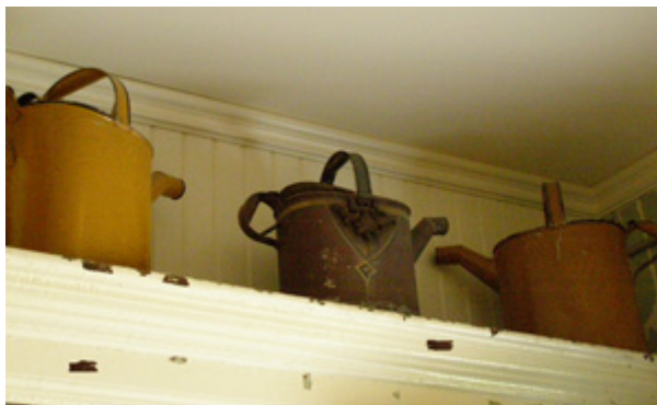
Watering Cans - Tribute to Potting Shed's Past

When one thinks of Spas, images of restful tranquility come to mind, which was what we experienced during pre-and post Spa treatments at The Potting Shed Spa. Located in the former estate Carriage House, The Potting Shed Spa pays tribute to its past with a collection of antique watering cans on a shelf over a door that has been stripped to expose its many layers of paint proudly bearing witness to its age and prior use.