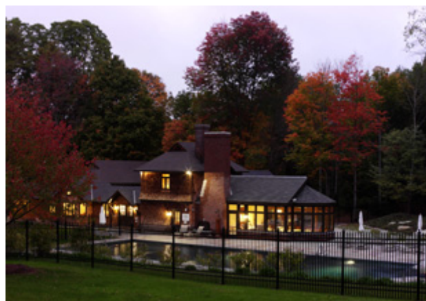
The Potting Shed and Swimming Pool at Night

The Potting Shed at Blantyre is open for Blantyre guests from 7:00 am until whenever and includes the common sauna, hot tub, steam room, and fitness area. In addition to treatments at the Spa, guests desiring additional privacy can arrange to have in-room treatments.