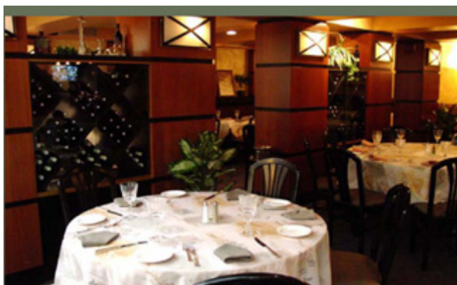
Giraffe Room Lounge and Restaurant