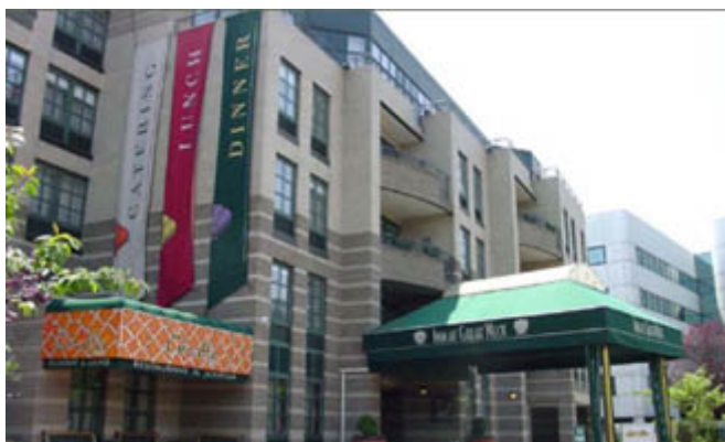
Inn At Great Neck

The lobby sets the tone with Art Deco décor and hand-painted murals on the walls, and continues with professional, personalized service at the reception desk. Edward and I stayed at the Inn at Great Neck in April 2010, and were impressed with the myriad of bells and whistles that this small hotel provides for the luxury traveler from opulently decorated guestrooms, excellent restaurant, well-equipped business center, high-speed complimentary WI-FI, and a state-of-the-art exercise room.