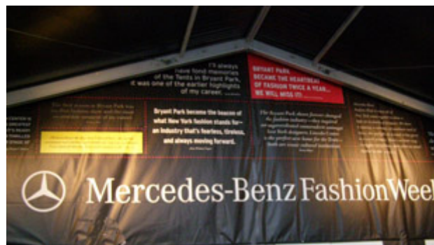
Entrance to Tent at Bryant Park

Once we walked up the stairs and entered the tent it was easy to forget that we were actually outside standing in Bryant Park. Gone were the trees, the older gentlemen playing chess at the metal tables and chairs, and it seemed perfectly natural to see two Mercedes-Benz automobiles flanking the entrance and an immense fountain surrounded by flat screen televisions providing highlights of past shows while waiting to be admitted for the next show in the Salon , the Promenade , or the Tent .