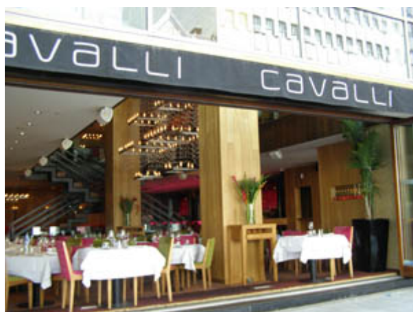
Cavalli Ristorante & Bar

It was lunchtime at Cavalli Ristorante & Bar, the day was warm and sunny, the retractable glass at the front of the restaurant was open with beckoning palm trees in black pots, and was bustling with traffic from the nearby businesses. The ambience at the restaurant is contemporary and comfortable with pink and green velvet chairs and banquettes, square tables are doubled draped with white linens and white napkins, framed mirrors add dimension to the open space, hanging yellow crystal fixtures studded with light bulbs add a touch of drama, wood paneling in the front of the restaurant feature sconces that accentuate the artistic silver animal horns dressed with black feathers gracing the walls, large vases placed throughout the restaurant hold exotic floral arrangements of Birds of Paradise, a long bar lines one wall of the restaurant, and a wrought iron and wood open staircase leading to the second floor adds a focal point to the room. Service is attentive by female waitstaff attired in lipstick red mini-cocktail dresses with matching lipstick red stiletto heels, while male waitstaff wear red and white striped shirts and dark pants.