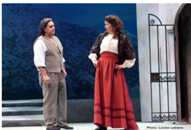
Cavalleria rusticana at Opera de Québec

Seeing Cavalleria rusticana by Pietro Mascagni in May 2009, 119 years after its debut performance in Rome, Italy, was indeed an exhilarating rush of adrenaline as we tried to imagine how the first audience to view Mascagni's work must have felt. The opera, beautifully sung in the original Italian with French subtitles by the stellar cast of the Opéra de Québec, is described as a peasant tragedy, realistic and violent in its telling, an ill-fated love story that takes place in the Sicilian countryside on a Sunday in 1890. It is a tale of love, betrayal, jealousy, and in the end, vengeance; it is a strong story of loss that tears at the heart with the thought of what might have been.