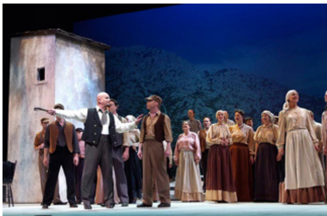
Cavalleria rusticana at Opera de Québec

We had the splendid fortune of being in the right place at the right time during a trip to Québec, Canada, where we had the opportunity to obtain tickets to the Opéra de Québec to see a double performance of the two famous Italian operas, Cavalleria rusticana and I Pagliacci .