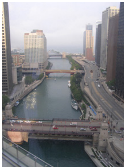
View from the Hotel

Trump International Hotel & Tower Chicago is more than just a pretty face; the hotel has the art of taking care of their guests down to a science from special programs for children to special services for small pampered pooches. Located 40 minutes from Chicago O'Hare Airport, the hotel is perfect for business as well as leisure travelers.