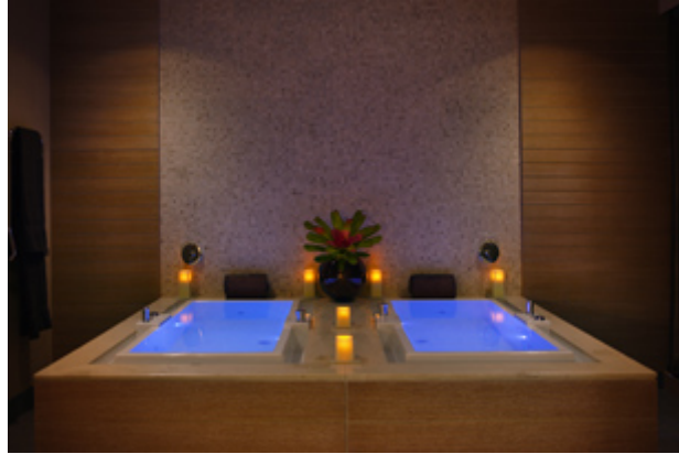
The Spa at Trump Chicago Pool

The Spa at Trump Chicago is an attractive 23,000 square foot space located on the 14th floor of the hotel that combines Spa services, a well-equipped state-of-the-art Health Club where guests may exercise with a view, and a 75-foot heated swimming pool where we felt like we were combining exercise with sightseeing as we swam laps on our sides and enjoyed the view. The Spa also offers Yamuna body rolling, Yoga, Spin, Pilates, Fit Circuit, Strength and Conditioning, Essential Flexibility, Water Workout, and Swim Technique classes. The Spa at Trump Chicago offers a wide range of pampering Spa treatments, which I indulged in during my stay.