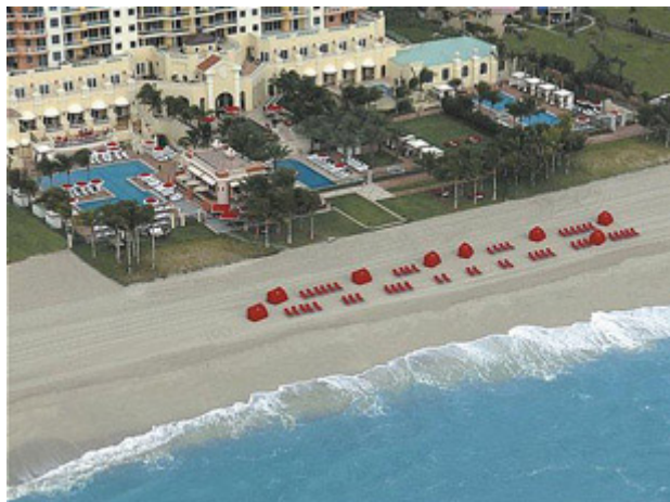
Aerial View of Acqualina Resort

from which to explore, and at the end of the day, it was nice to be back in Sunny Isles.