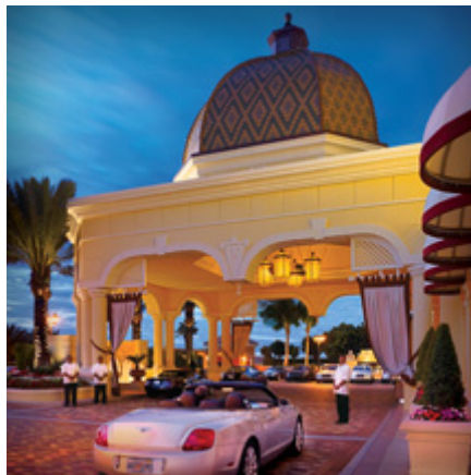
Acqualina Resort Porte Cochere Entrance

A plethora of prestigious automobiles that included a Bentley, Maserati, Rolls Royce, Maybach, and Mercedes Benz in the parking lot added sophisticated cachet, however it was the Porsche Carrera GT that caught my eye with its sleek sexiness.